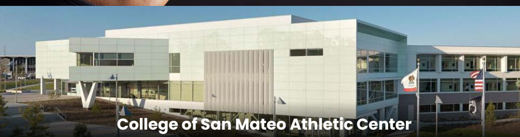
College of San Mateo Athletic Center

comfit.smccd.edu • sanmateoac@smccd.edu • (650) 378-7373