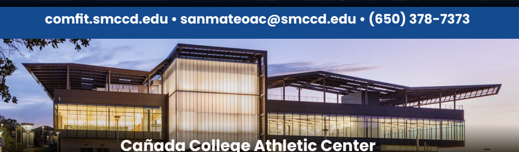
Cañada College Athletic Center

comfit.smccd.edu • sanmateoac@smccd.edu • (650) 378-7373